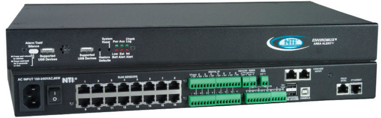
ENVIROMUX-16D (Front & Back)