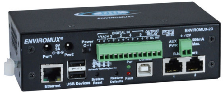
ENVIROMUX-2D (Front & Back)