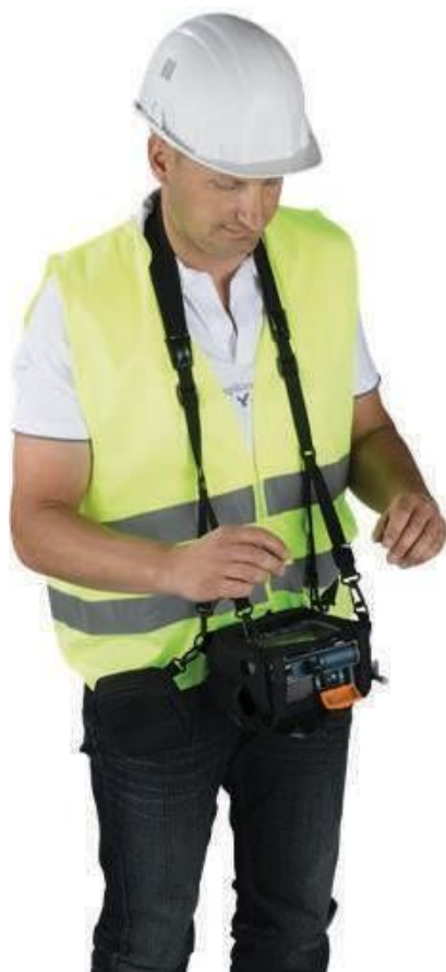
Hands-free FiberXpert strap